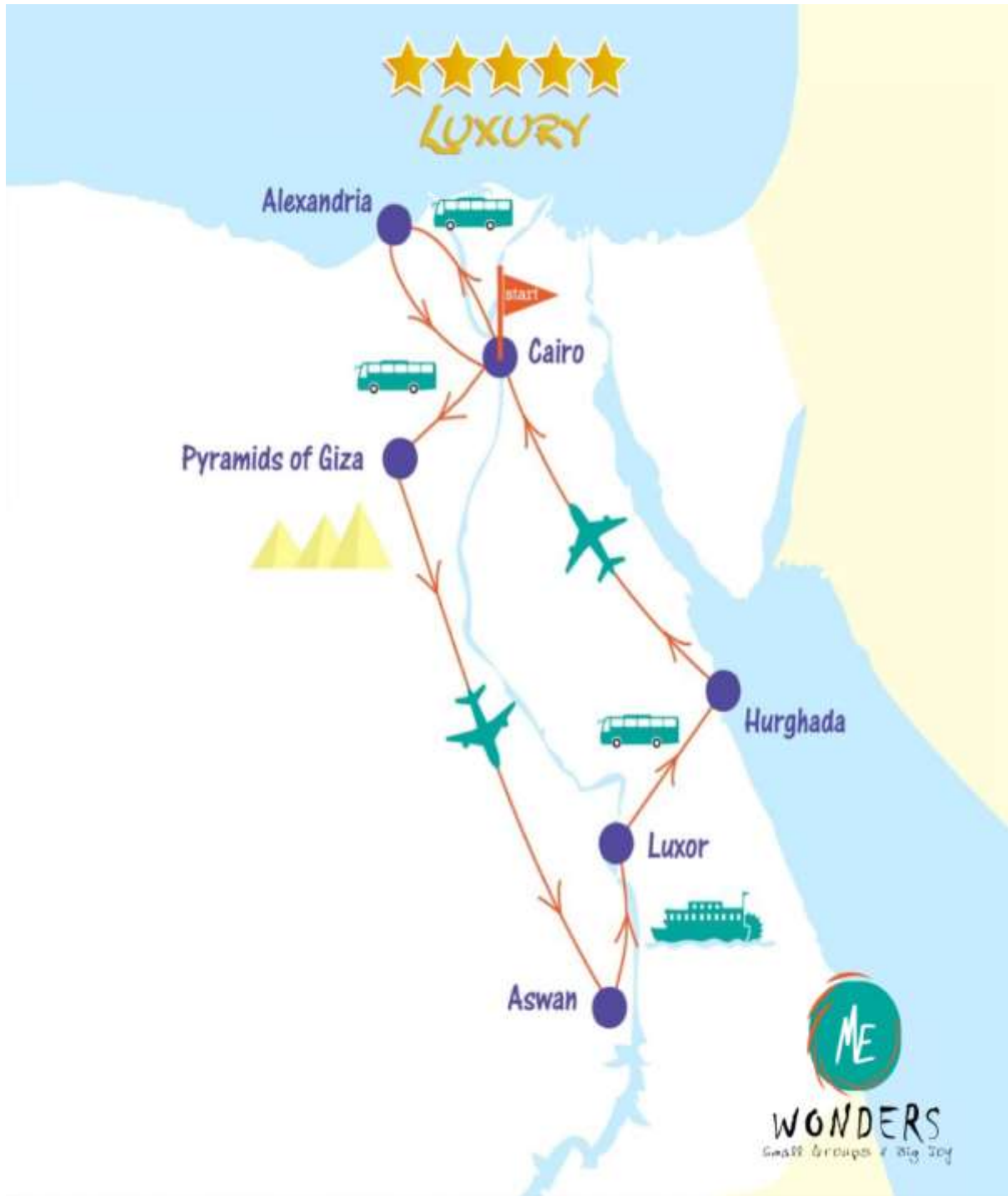
Figure (1): Egypt Comfort Tour