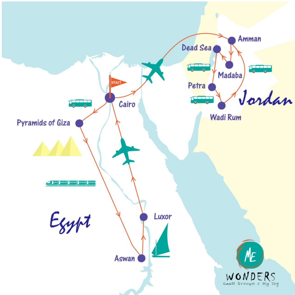
Figure (1): Egypt and Jordan Combo