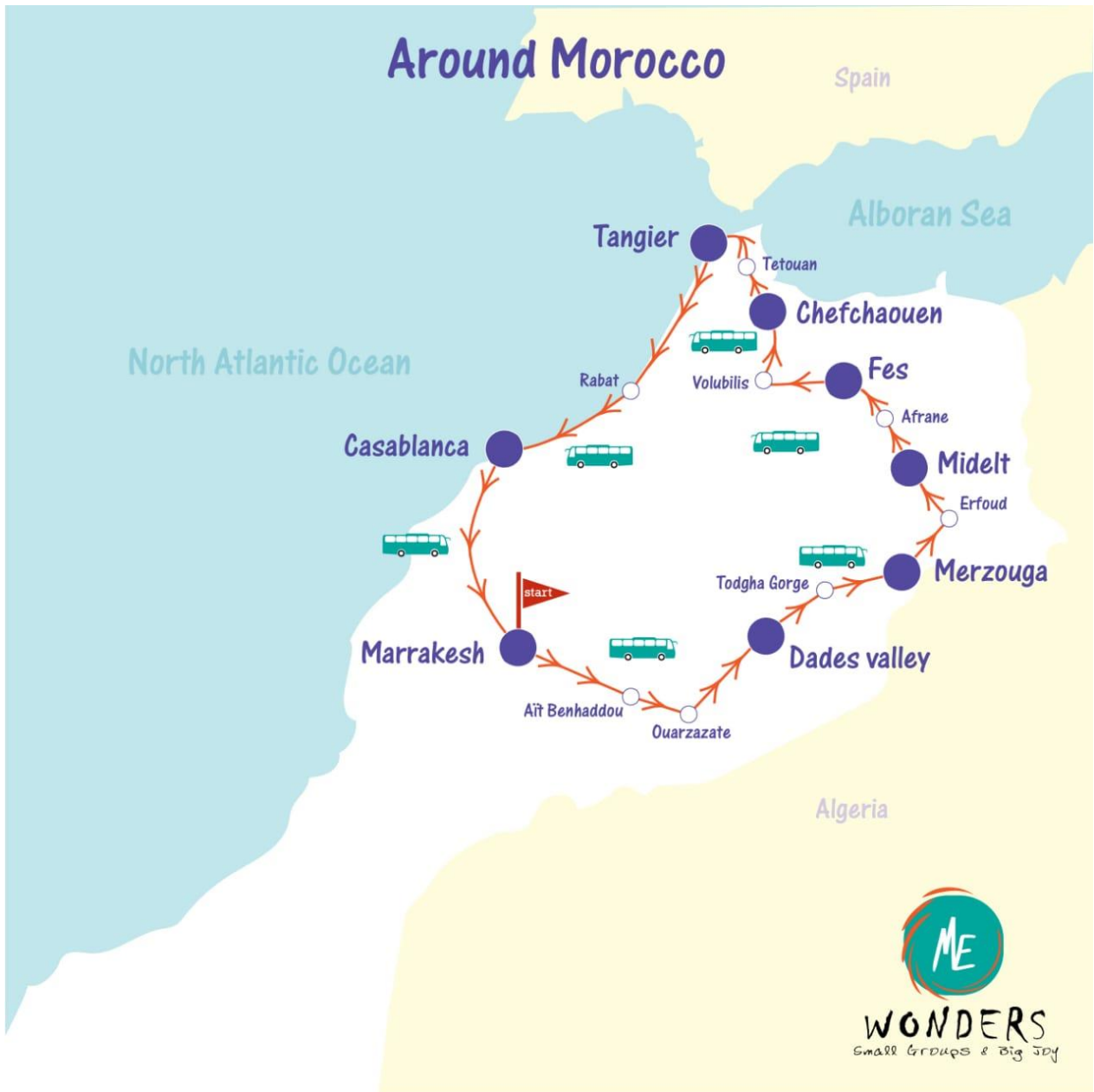
Around Morocco Tour