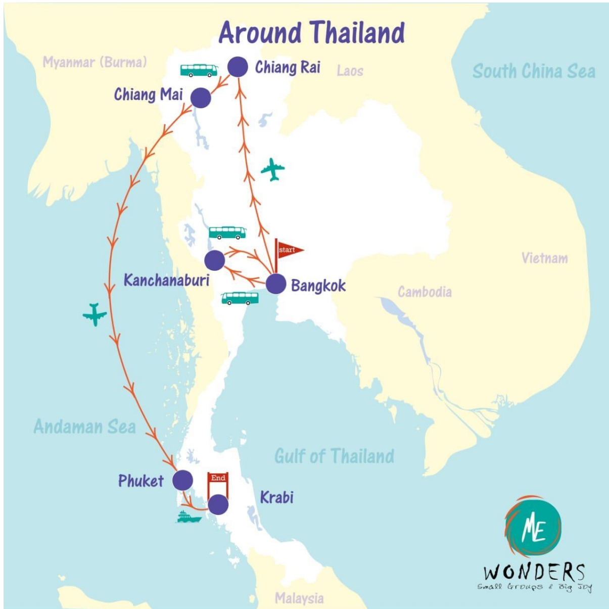
Figure (1): Around Thailand Tour