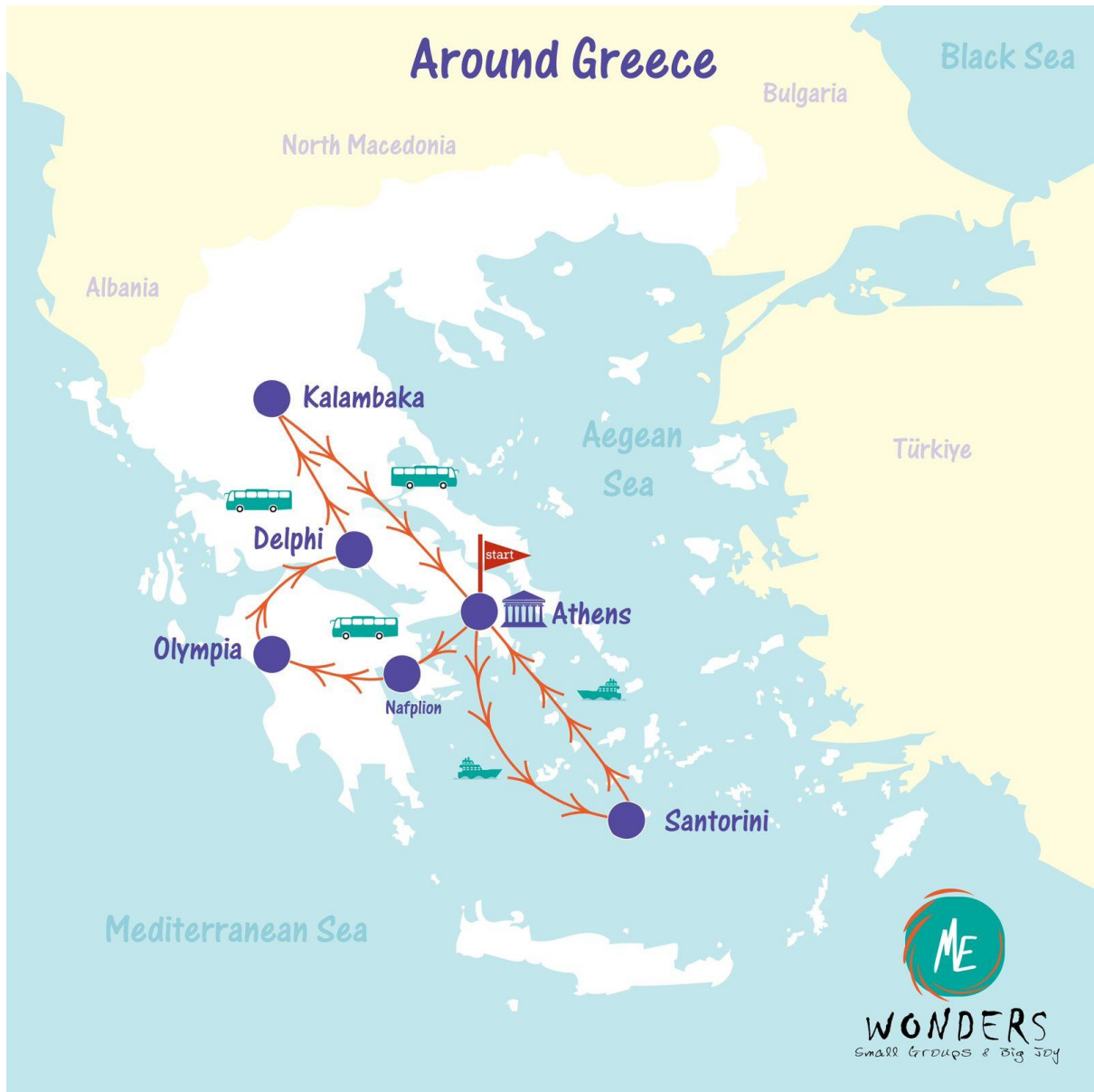
Figure (1): Around Greece Tour