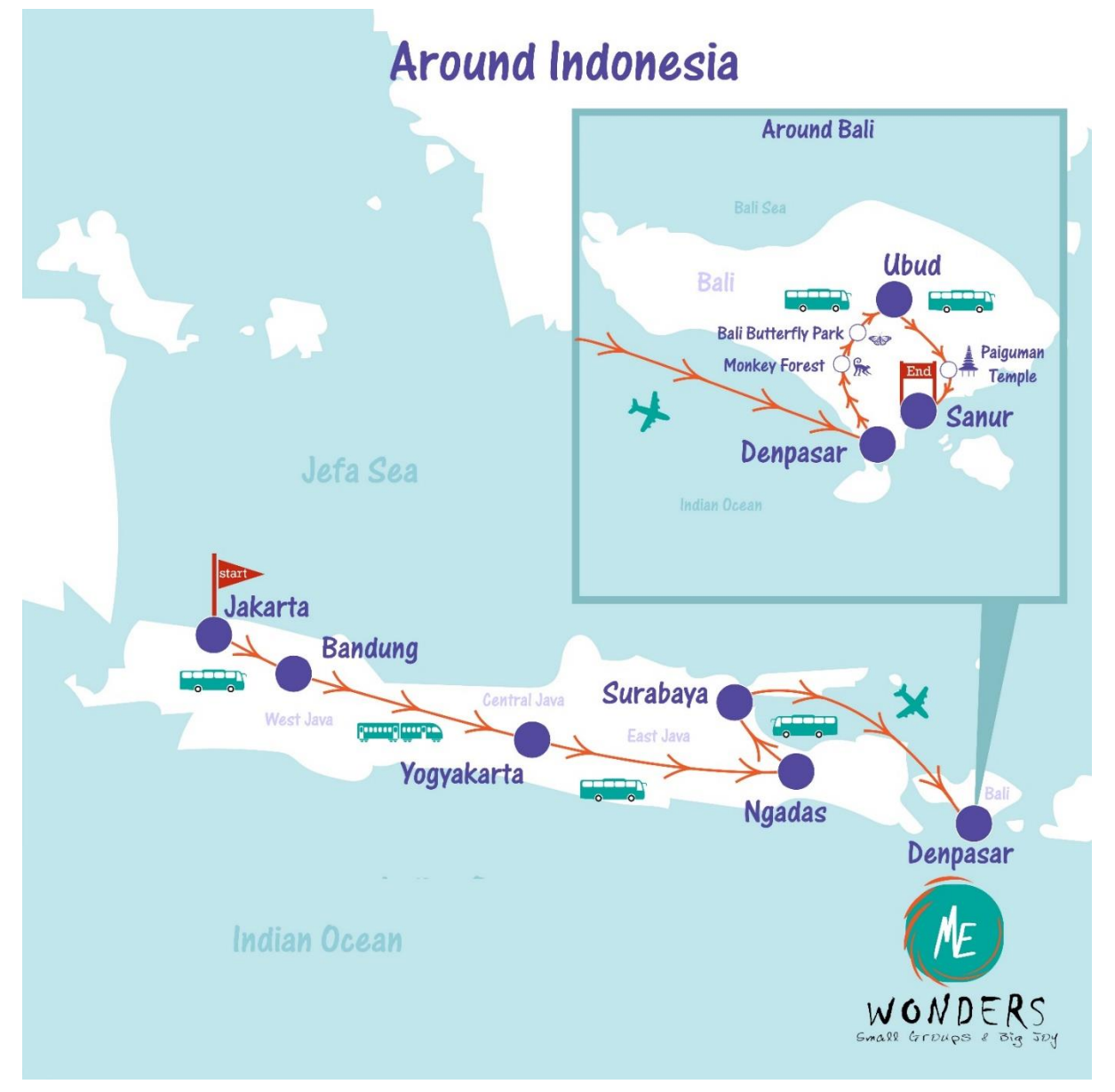
Figure (1): Around Indonesia Tour