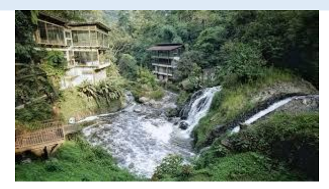
Page 3 of 9