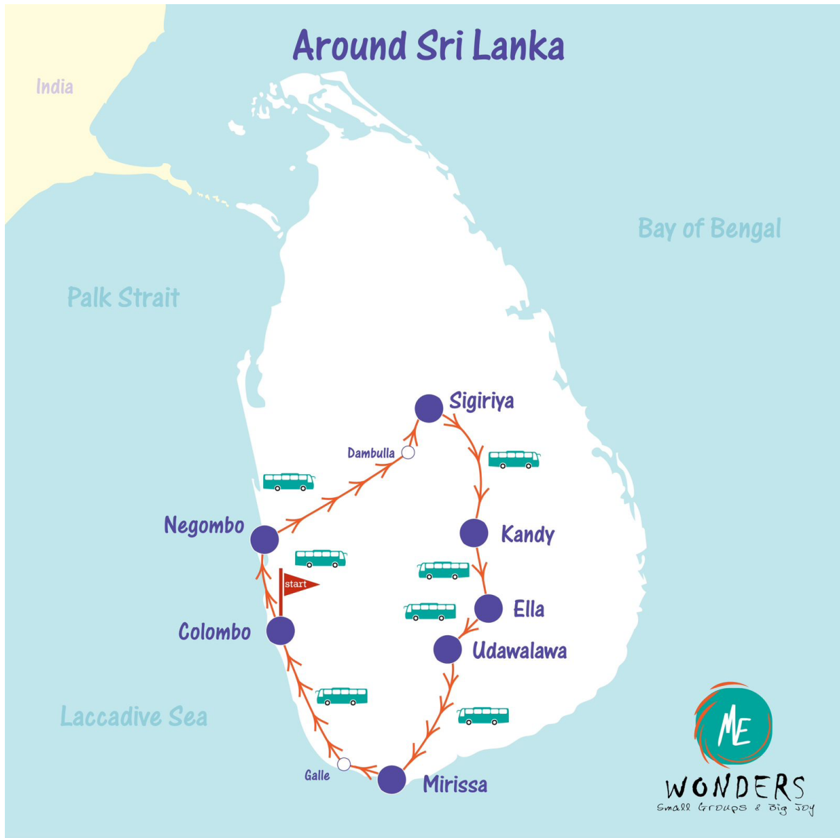
Around Sri Lanka Tour