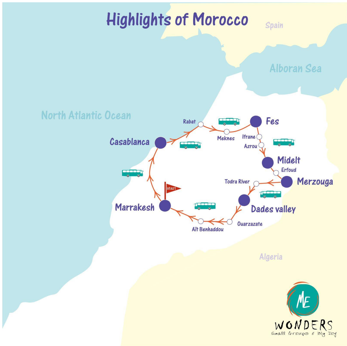
Highlights of Morocco Tour